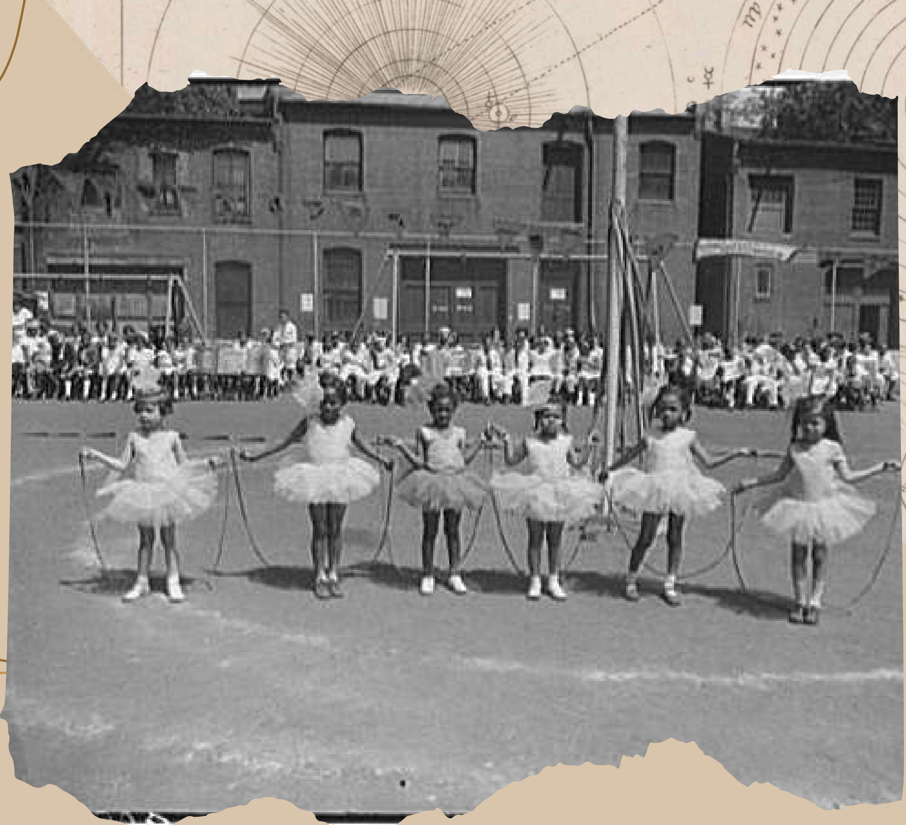
Children. Colored children in May pole dance VIII. District of Columbia Washington D.C. United States Washington D.C, None. ca. 1920-ca. 1950. [Photograph]