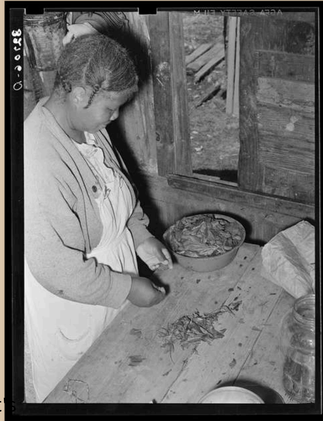
Woman preparing "poke-salad" near Marshall, Texas in March 1939

I wonder what poke salad is and how/when it's prepared. Also, I would like to engage in the preparation of poke salad with them.