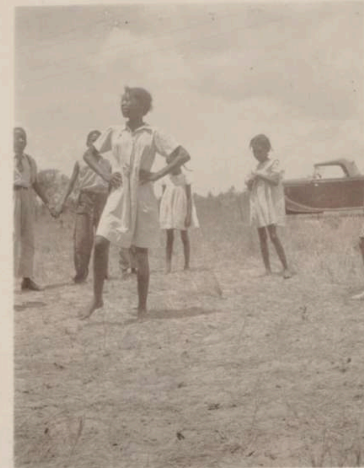
[African American children playing singing games, Eatonville, Florida. June 1935]