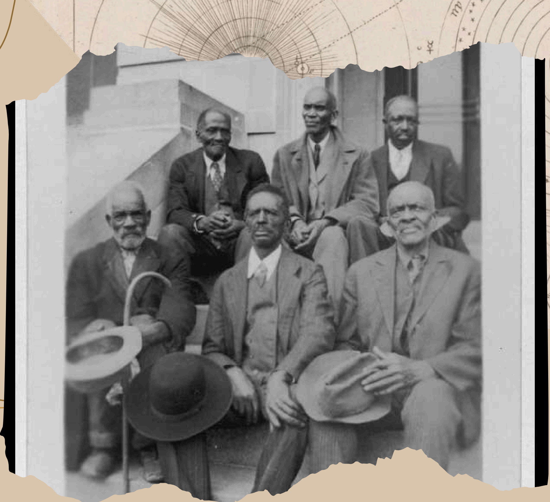
(1937) Attendants at Old Slave Day, Southern Pines. United States North Carolina Southern Pines, 1937. Apr. 8. [Photograph]

I wonder what gathering they are attending? Is it a celebration? I wonder if their families might be gathered with them. I would ask what I might do to honor or celebrate you.